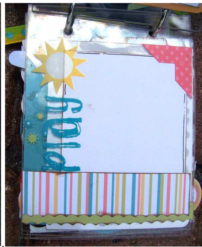
2 nd page