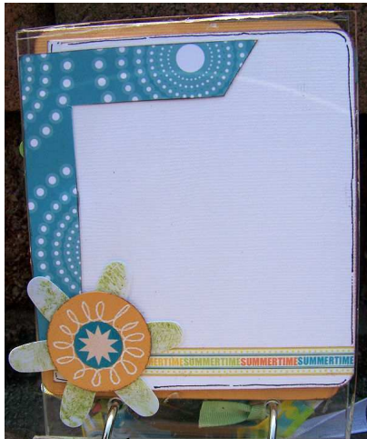
3 rd page