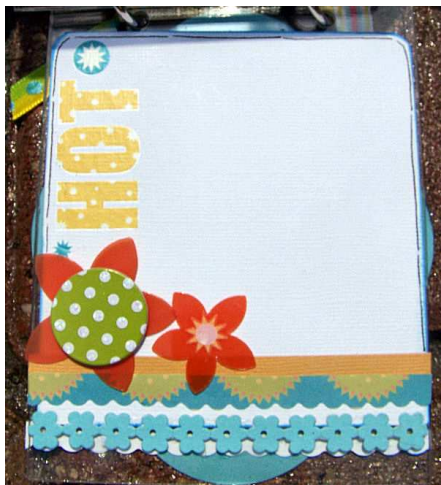
6 th page