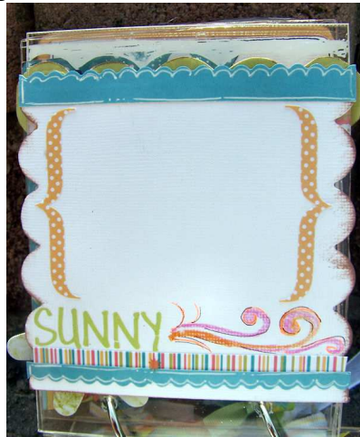
5 th page