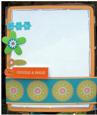
1 st page