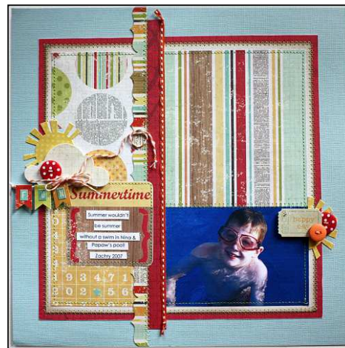
Shellye {July Guest Designer}