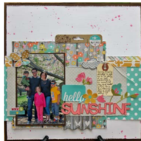
Staci {Guest Designer}