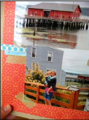
Photo Corners: I love the look of washi tape over photo corners. This is such an easy way to add some color or pattern to your page, and give an "old scrapbook" style look to your pages.